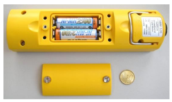
The battery compartment is opened easily using a coin. Two replaceable NiMH rechargeable batteries (AA size) are used to power the device.