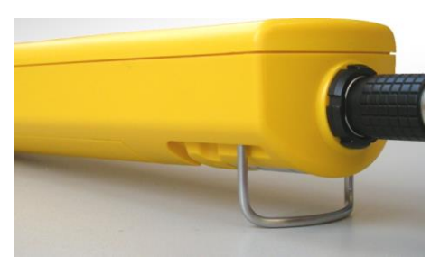
The optical interface connector and AC adapter / charger connector compartment is sealed with a rubber cap. The tilt stand provided in addition to the tripod bush can be used to place the instrument securely on a flat surface.