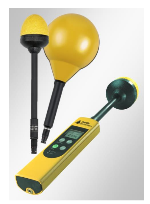
Changing the probe is quick and easy, with no need to reconfigure the device