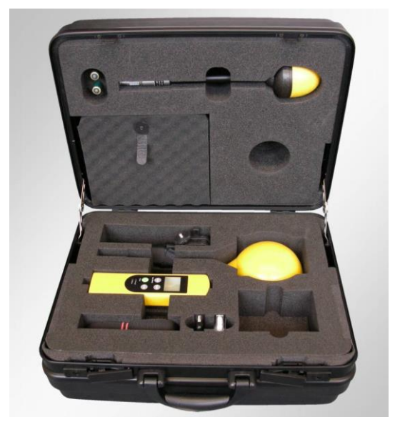
A rugged transport case is included. This provides ideal protection for the instrument, together with up to two probes and all accessories.