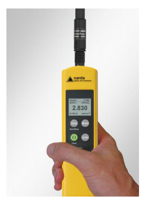
Small, lightweight and rugged design – ideal for use in rough environments