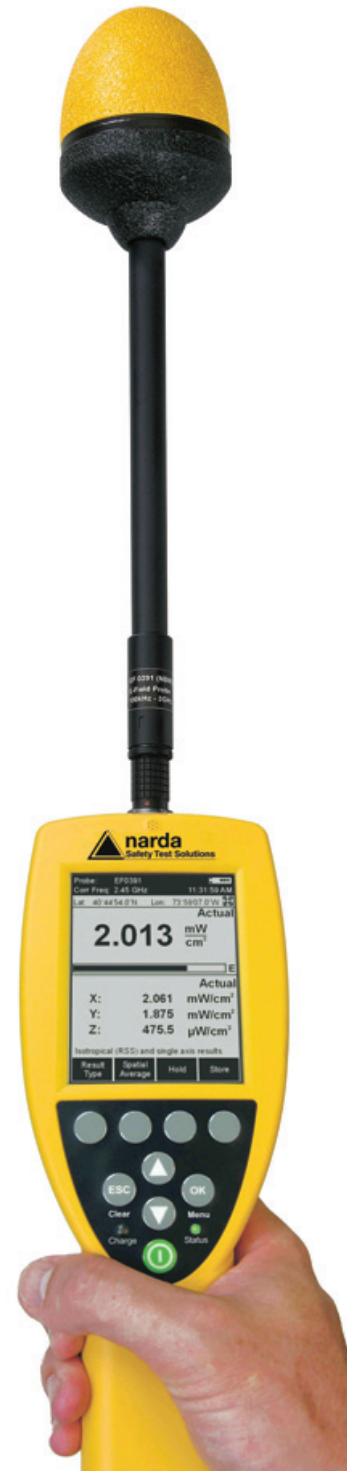
Rugged and lightweight housing, designed for easy one-hand operation