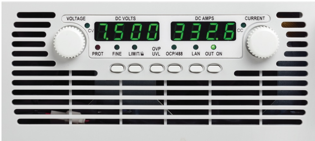
Figure 1. Front panel control knobs and buttons make the N8700 easy to use in a system and on the bench

The N8700 Series power supplies comes standard with GPIB, Ethernet/LAN, and USB 2.0 interfaces giving you the flexibility to use your I/O interface of choice today and safeguard your test setup for the future. The N8700 is fully compliant with the LXI Class C specification.