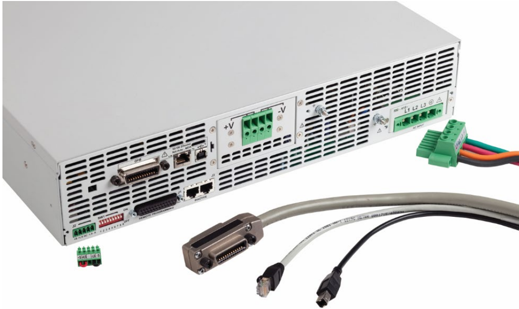
Figure 2. The N8700's standard LAN (LXI C), USB 2.0 and GPIB interfaces enable simple system connections