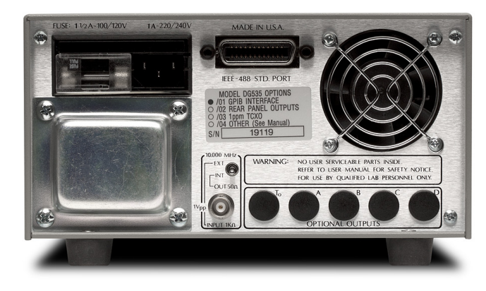
DG535 rear panel (with Opt. 02)