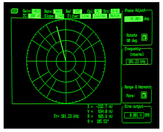
Polar plot display

defining an appropriate trace. Trace values can be displayed as a bar graph with an associated large numerical display, or as a strip chart showing the trace values as a function of time. Additionally, you can display polar plots showing the phasor formed by the in-phase and quadrature components of the