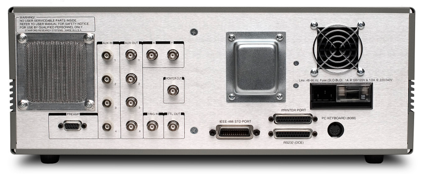
SR850 rear panel