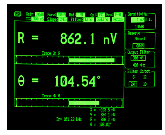
Large numeric readout with bar graph

to 512 Hz, you are able to see exactly how your data changes in time—not just what the current output value is. After the data has been acquired, the SR850 offers a variety of data reduction options, such as Savitsky-Golay smoothing, curvefitting and statistical analysis. A built-in 3.5" disk drive, along with standard RS-232 and GPIB interfaces, makes it easy to transfer data to your computer.