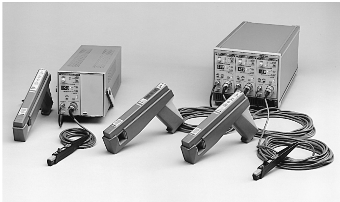
AM503 Current Measurement Family