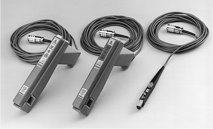
A6303XL, A6304XL, and A6302XL. The Eight-meter XL Series Current Probes.

A6312 • A6302 • A6302XL • A6303 • A6303XL • A6304XL • CT4 Data Sheet