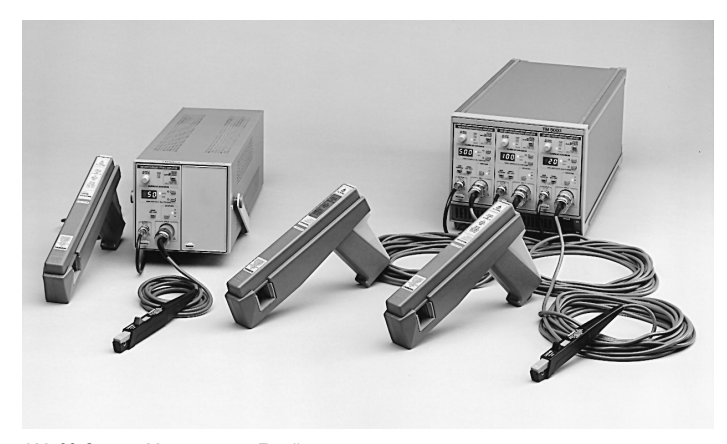
AM503 Current Measurement Family