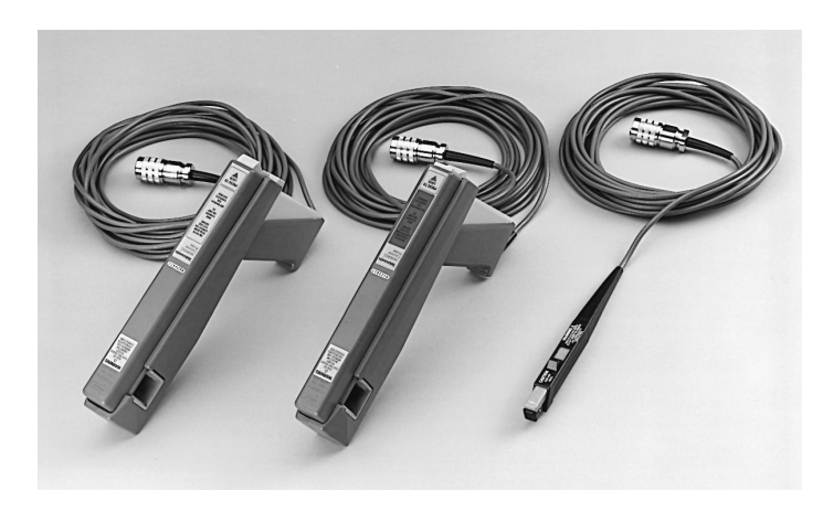
A6303XL, A6304XL, and A6302XL. The Eight-meter XL Series Current Probes.