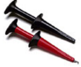
AC280-FL: Hook Clips.