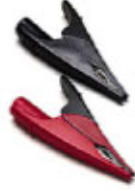
AC285-FL: Alligator Clips.